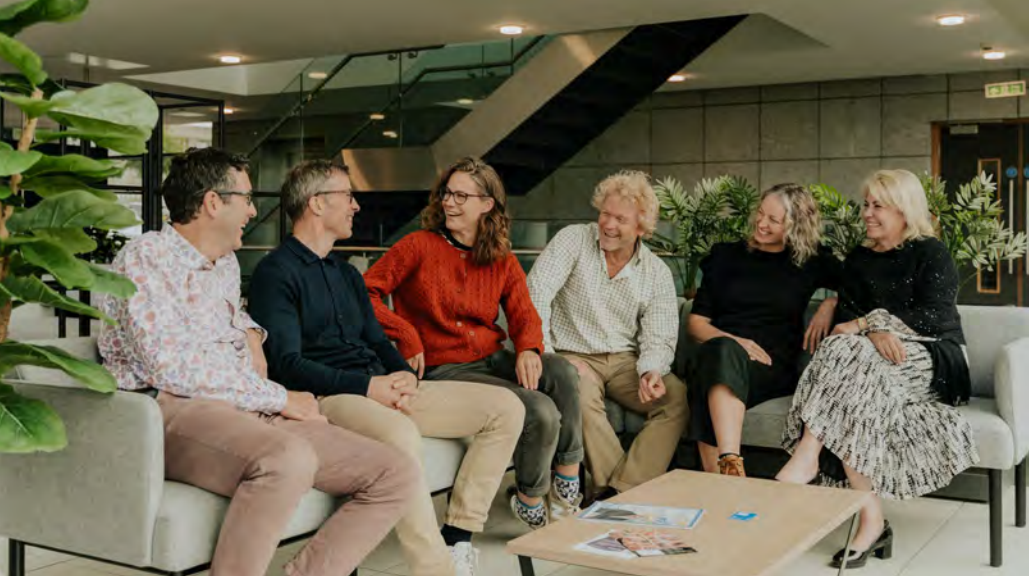
The Transform Health Team in the Truro clinic